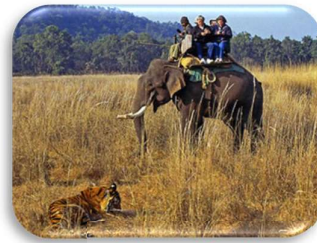
Nanital Jim Corbett