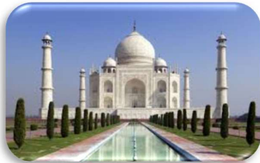
Delhi – Agra Ranthambore Jaipur