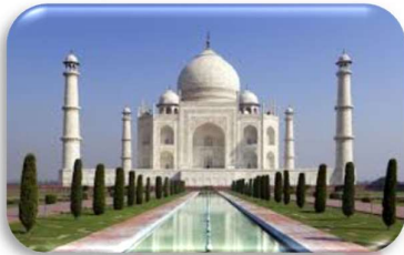
Delhi – Agra Ranthambore Jaipur