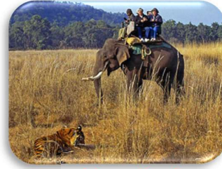
Nanital Jim Corbett