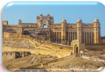
Jodhpur Jaisalmer Sand Dunes Udaipur