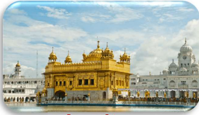
Amritsar Dharamsala Dalhousie